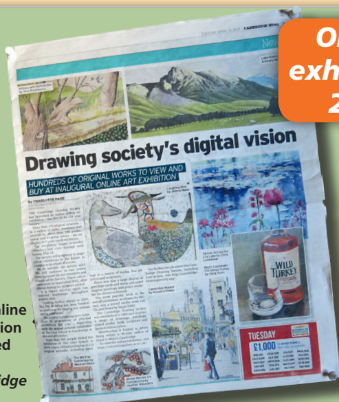
CDS online exhibition featured in the Cambridge News