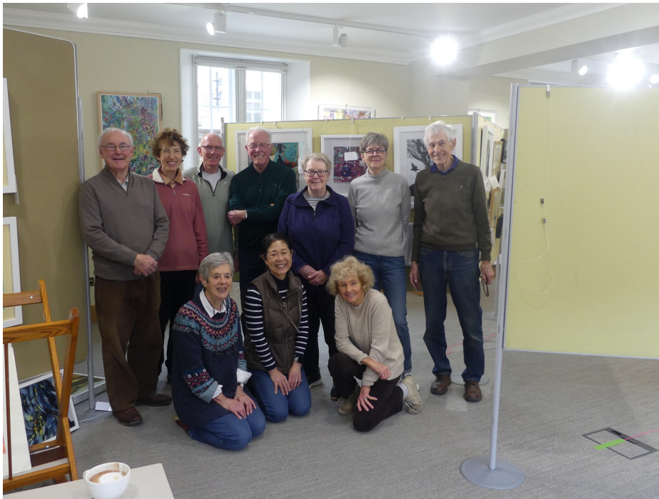
Happy faces at the end of a morning hanging