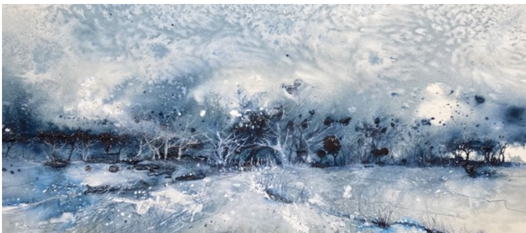
Winter Crunch - Penny Newman