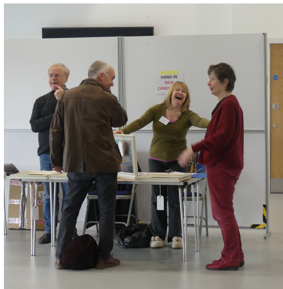
The sheer joy of helping at Cottenham Village Hall

In spite of the closure of the Pitt Building car park and having to receive much of the members' artwork, and return unsold work, at the Cottenham Village Hall the logistical operation went very smoothly.