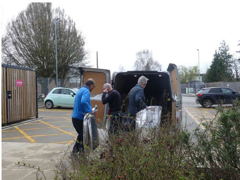
Loading the white van at Cottenham Village Hall