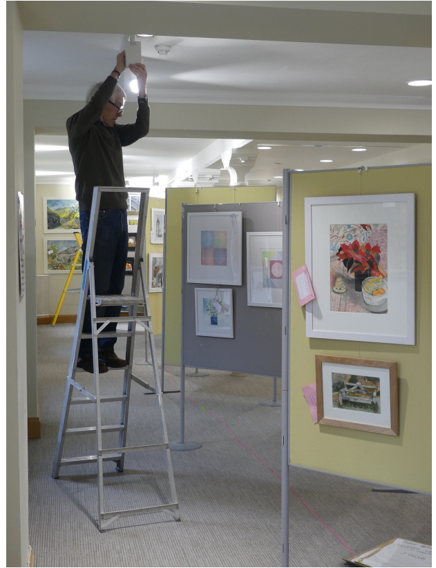
Getting the lighting just right at the Pitt Building