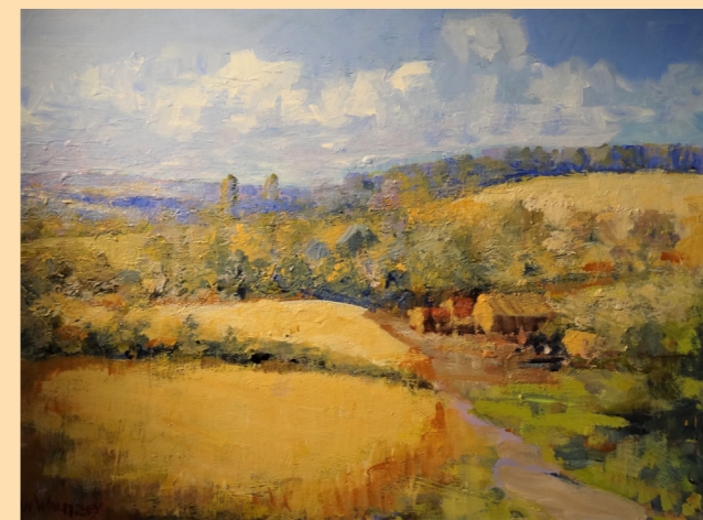
View towards Wimpole