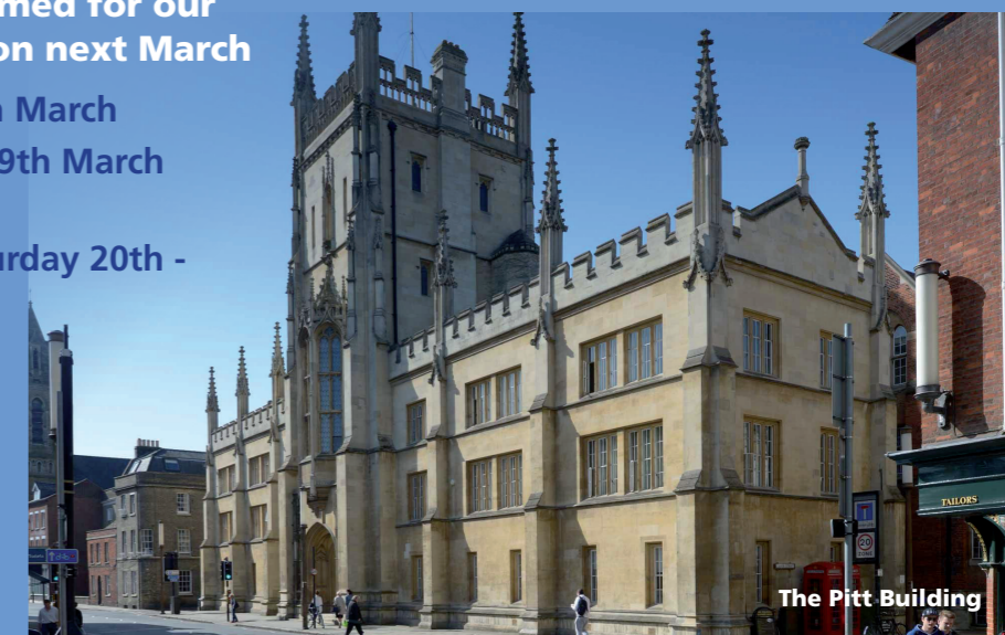
The Pitt Building

Between now and the exhibition we will be keeping a very close eye on the coronavirus situation, and this may well result in changes to the above. We will be keeping Members and Friends informed.